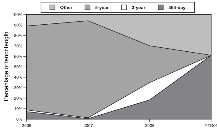
Fig. 4: Banks push for shorter tenors